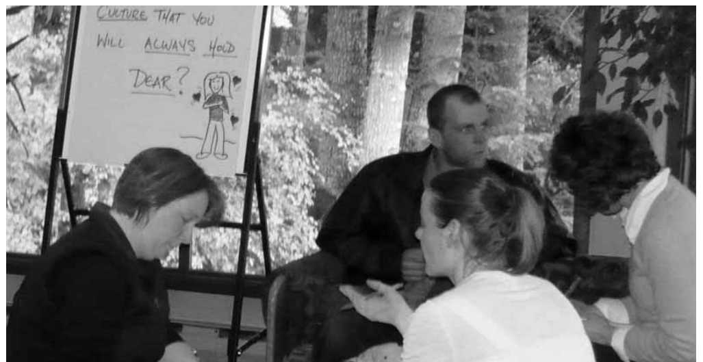
College faculty and staff taking part in the VISION 2020 process.

Please view the VISION 2020 document at: http://peernet.lbpc.ca/announce/PearsonVision2020.pdf